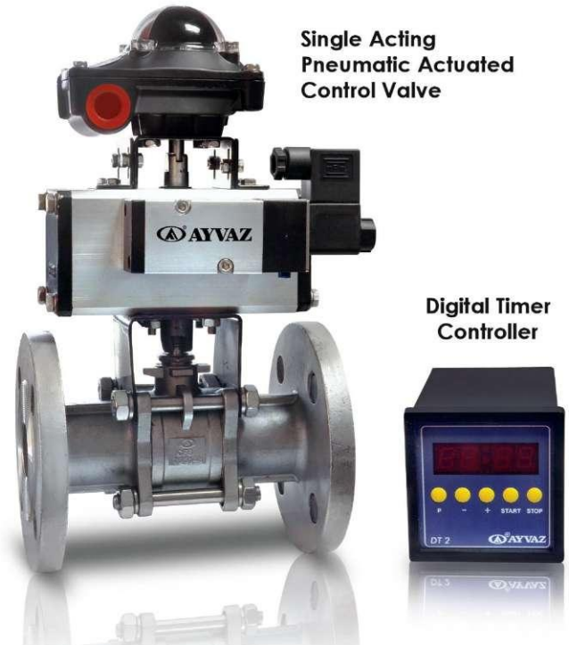
Single Acting Pneumatic Actuated Control Valve

Note : The settings are not changed when the 220 V 50 Hz power is cut off in the timer.